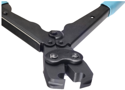
Hand Installation Pincer for Ear Clamps HIP 7000 | 425