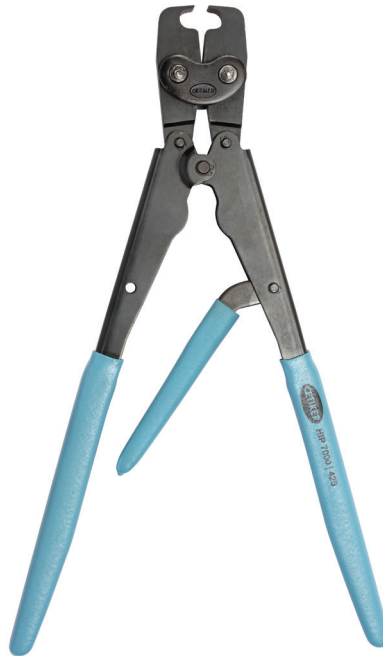
Hand Installation Pincer for Ear Clamps HIP 7000 | 425 Item No. 14100425

Increased handle length: Higher closing force