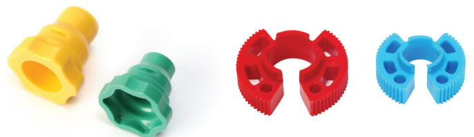
Shipping plug, disconnect tool and assurance cap