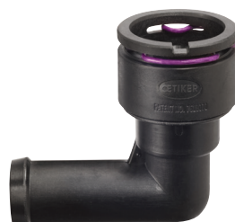
90° Elbow PG220